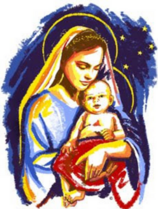
Our Lady of the Southern Cross

The infant Church in Australia had a special reason for turning to Mary. In those early and mostly priestless days, it was largely the Rosary that kept the faith alive. Australia was the first nation to choose Mary, under the title of Help of Christians, as principal Patroness.